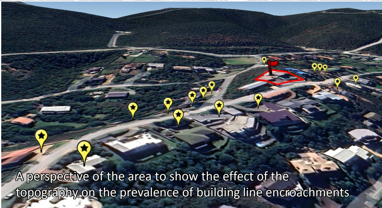
A perspective of the area to show the effect of the topography on the prevalence of building line encroachments