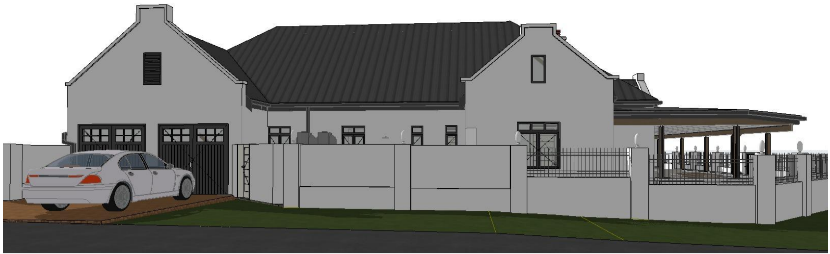
Hart Street view