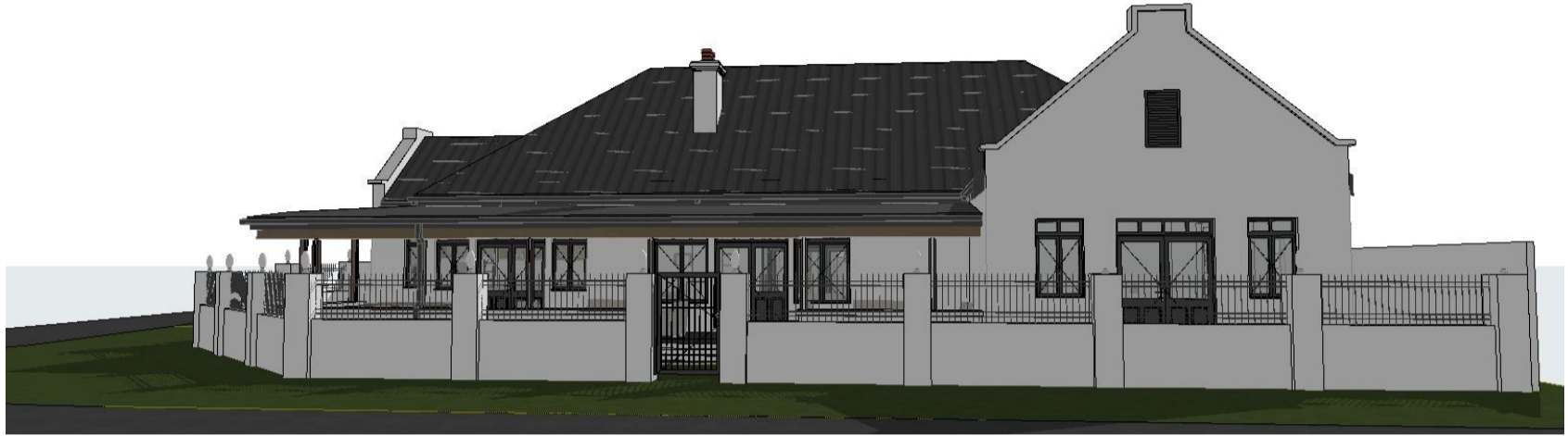
Tidswell Road view