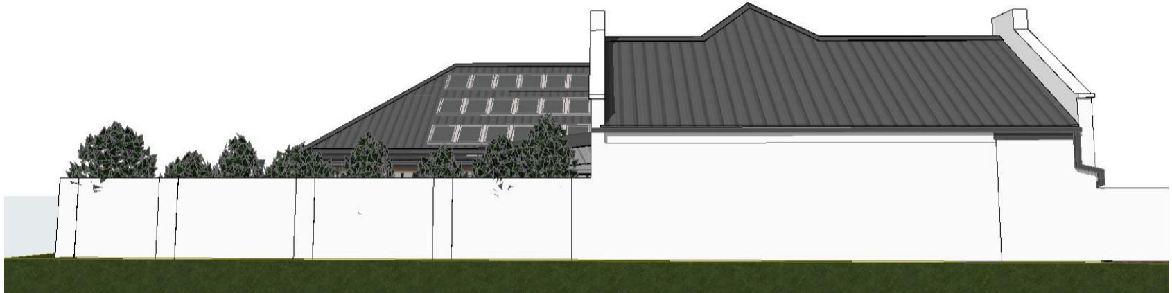
Neighbour 2 View