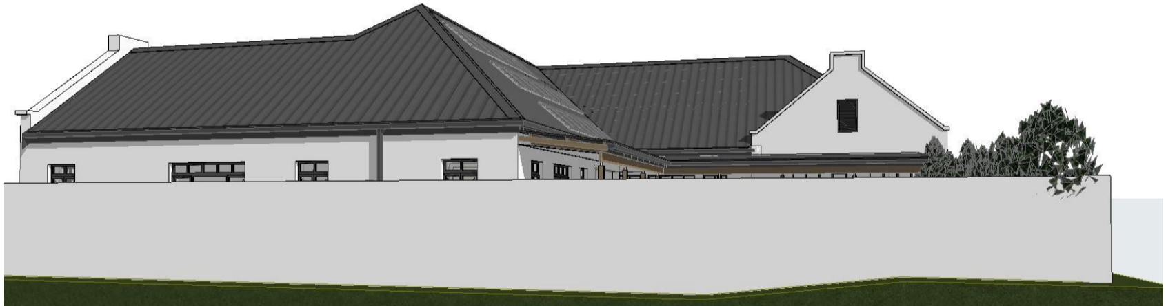
Neighbour 1 View