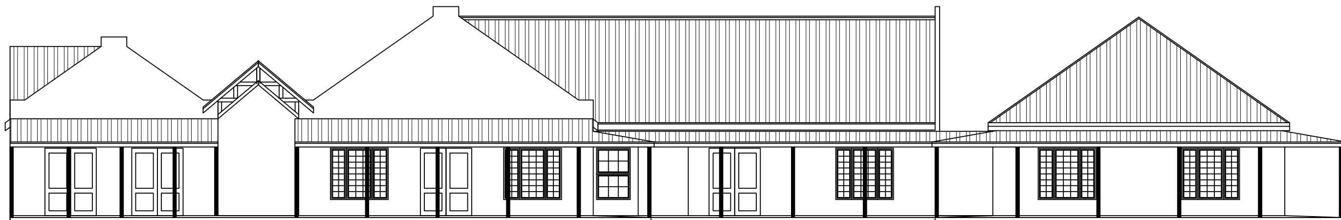
EAST ELEVATION Scale 1:120