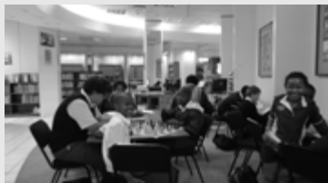
The well-lit children's section of the temporary library in Woodmill Walk Centre is very popular on weekdays.

The contact telephone numbers for the Main Library in Woodmill Walk will be 044 302 6308 and 044 302 3212.