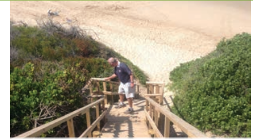
Tourism facilities at Cola & Myoli Beach

Council introduced the Ward Project Programme during the 2011/2012 financial year and with the support of the Ward Councillors and Ward Committees, the programme has achieved great success to date. To celebrate the successes, we will feature some of the projects in the various Wards, starting with Ward 1 and 2.