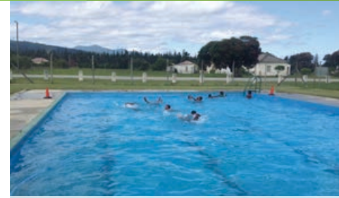
Refurbished Karatara swimming pool