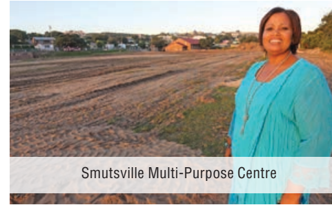
Smutsville Multi-Purpose Centre

In terms of a National Treasury directive all the ward projects must be identified and specified in the budget if they are of a capital nature. Performance against the budget is reviewed quarterly. Projects are funded by own municipal funding and Municipal Infrastructure Grants (MIG).